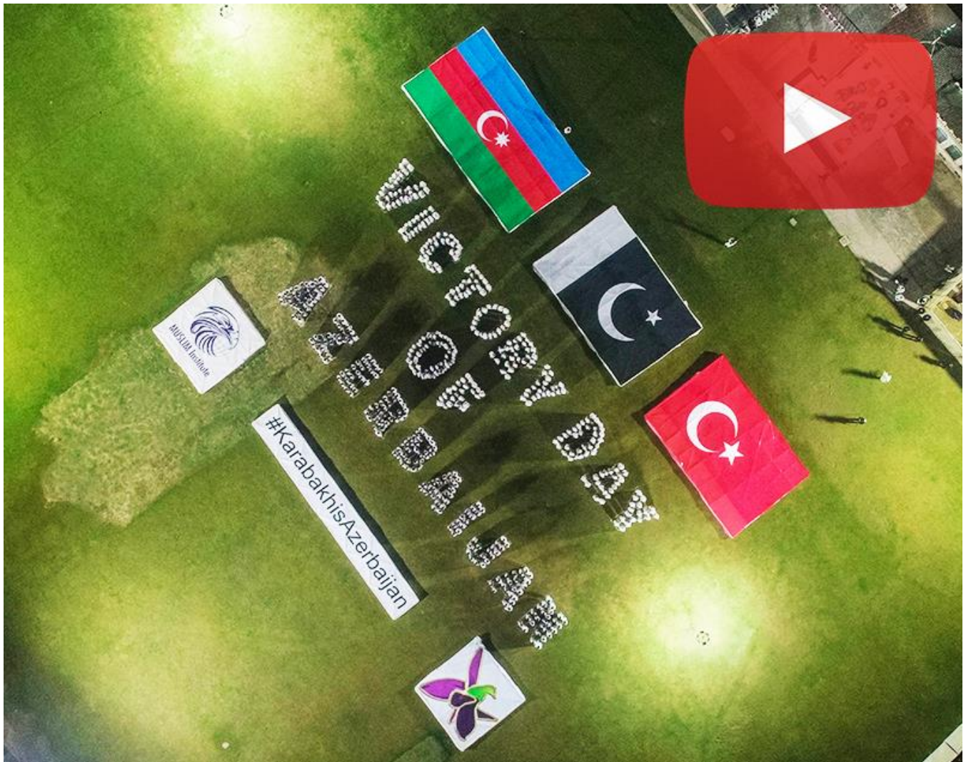
Click on banner to play compilation video of human model of Victory Day of Azerbaijan at YouTube.

To mark the Victory Day of Azerbaijan – 8th November 2022 – MUSLIM Institute organized proceedings that featured a human model honouring the completion of two years since Azerbaijan’s victory in Karabakh. Thousands of Pakistanis came together at the Shrine of renowned Sufi Saint, Hadhrat Sultan Bahoo, near Shorkot, Pakistan, and arranged themselves in formation to spell out “Karabakh is Azerbaijan” and “Victory Day of Azerbaijan.” On the occasion, flags of Pakistan, Azerbaijan, and Turkey were also displayed. Participants chanted slogans of “Karabakh is Azerbaijan,” “Azerbaijan Pakistan Qardaş Qardaş,” and “Pakistan Celebrates Azerbaijan Victory.”