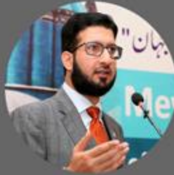
Sahibzada Sultan Ahmed Ali

Federal Minister of States and Frontier Regions Guest Remarks