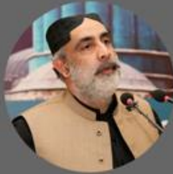
Sahibzada Muhmmad Mehboob Sultan

Federal Minister of States and Frontier Regions Guest Remarks