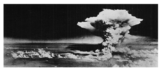
Nuclear Bombing of Japanese city of Hiroshima in WWII

The sovereignty of a state – which is protected under United Nations Charter Article 2(4) – is nothing to be taken lightly. Hence, when the Indian Air Force <u>breached</u> Pakistan's sovereignty on 26th February 2019, it was considered as a major act of aggression, thereby exacerbating the tensions.