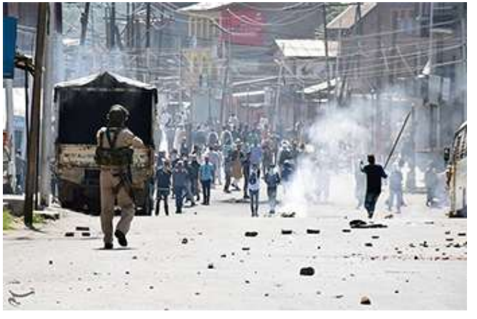
Protests in Kashmir

In the <u>words</u> of former UN High Commissioner on Human Rights, "the political dimensions of the dispute between India and Pakistan have long been centre-stage, but this is not a conflict frozen in time. It is a conflict that has robbed millions of their basic human rights, and continues to this day to inflict untold suffering".