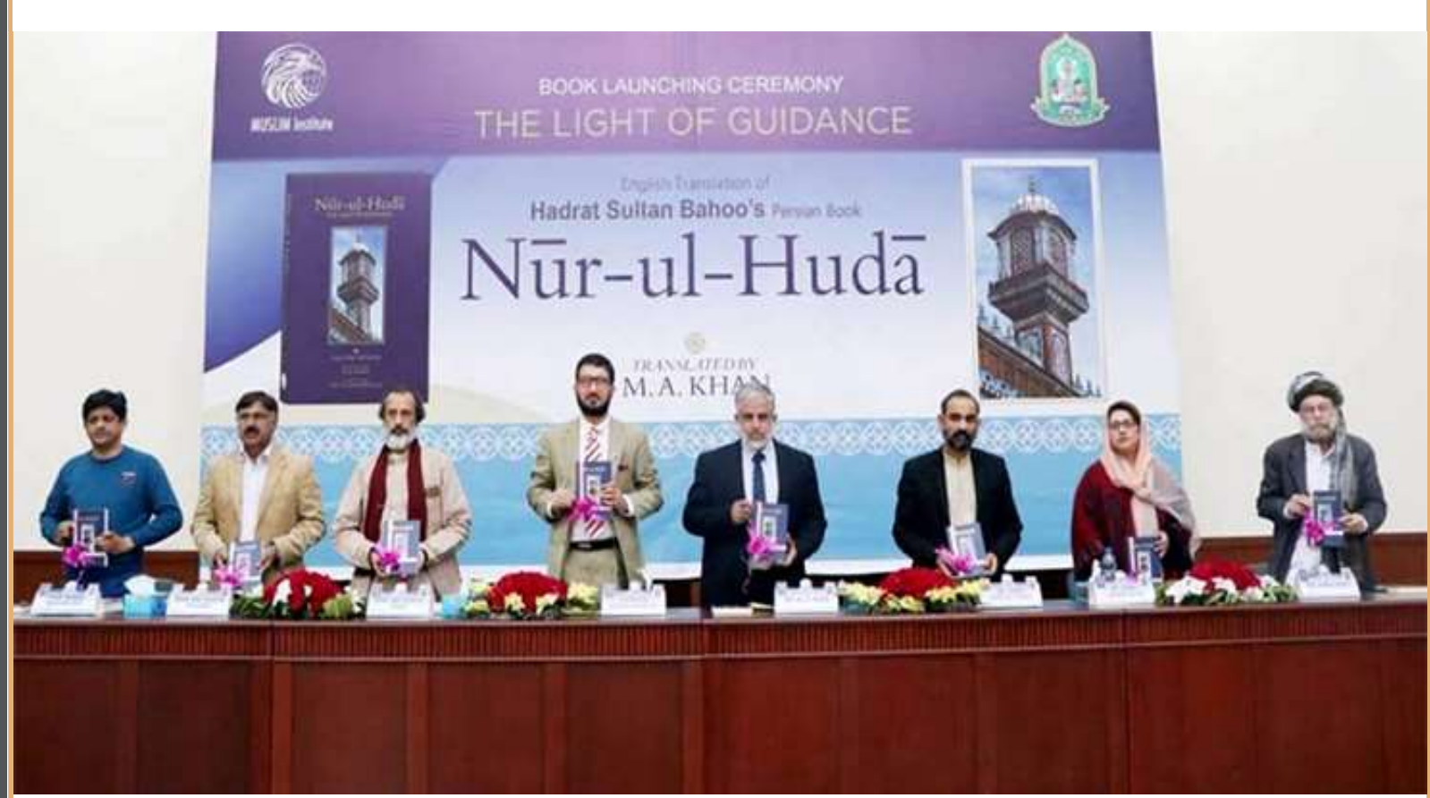
Stage view of ceremony.