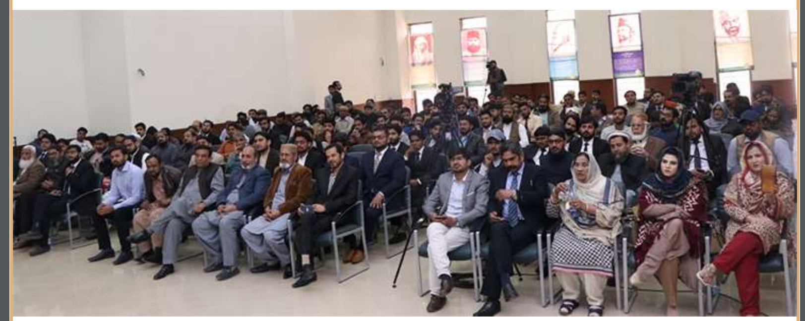
Participants view during the book launching ceremony.