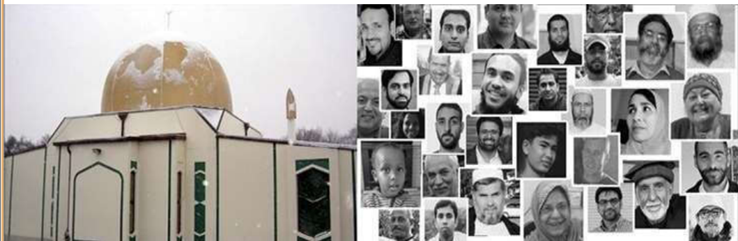
Al-Noor Mosque in Christchurch and the Martyrs

The manifesto is the culmination of white nationalism and fascist ideology – which the attacker very proudly accepts to be associated with – citing the ‘white genocide’ theory that preposterously claims that white people are being driven into a demographic change. He takes inspiration from other white nationalist terrorists that also used weaponry to commit mass shootings such as Andres Breivik – who killed 77 people in Norway in 2011 – and Dylan Roof – who killed 9 African-Americans in a church in Charleston in 2015. If someone thinks that Christchurch was a one-off act of Islamophobia, and that the demented 28-year-old was merely a ‘bad apple’,