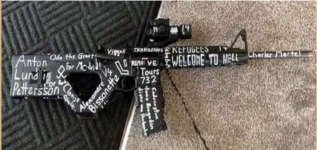
Weapon used in Christchurch Attacks

In all of the above incidences of militarized Islamophobia, the fact that the attackers chose the place of worship for their attack suggests that they were well-prepared – like in Christchurch – with weapons and a plan or strategy mirroring that of a military mission or operation. In this day and age, where anti-Muslim hate crimes have reached the new heights of militarized Islamophobia,