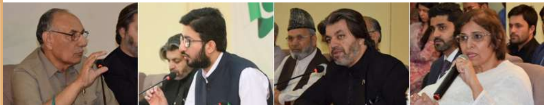
Participants and speakers during Interactive session.