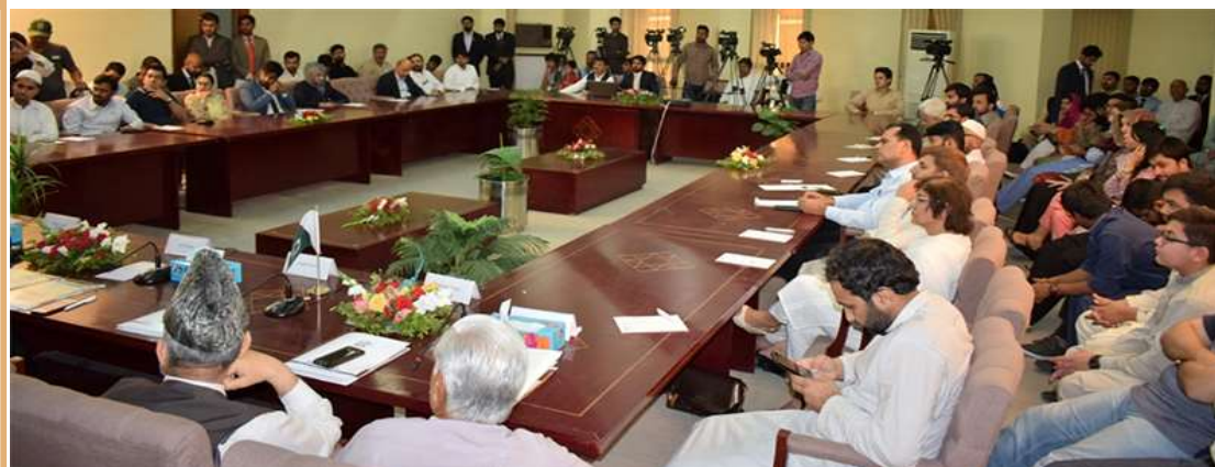
Hall View during the Seminar.