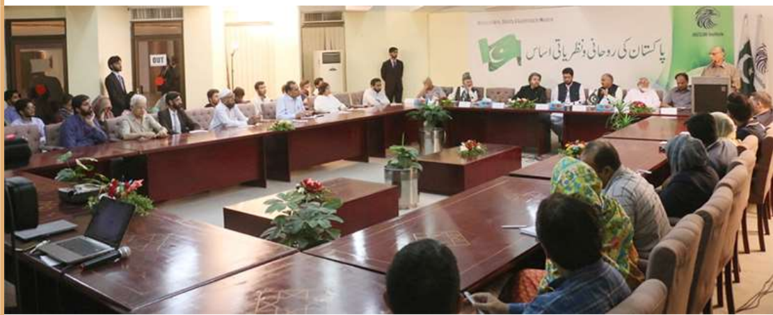
Stage view of seminar.

Quaid-e-Azam made it clear in 1937 that Muslim should dwell upon circumstances vigilantly and decide about their fate. Otherwise, Muslims will be themselves responsible for their destruction and downfall.