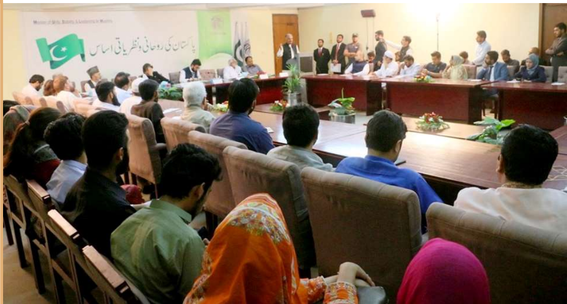
Participants view during the Seminar.