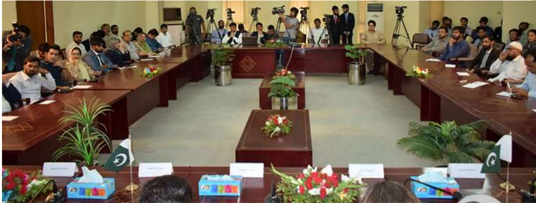
Participants view during the seminar.

There may be two reasons for extreme tendencies in any society. First is lack of proper understanding of religion, and second it may have any malicious agenda in the background. Whoever is bestowed with understanding of religion, he will develop tolerance and the solution is uniting the matters of world and religion. We have segregated our religious circles from the worldly business. Similarly, those dealing with worldly matters lack in religious knowledge. In past, both worldly as well as religious knowledge were imparted in the seminaries of subcontinent. In addition to Holy Qur'ān, Ḥadīth and Fiqh, Students of seminaries were taught mathematics, social sciences and philosophy.